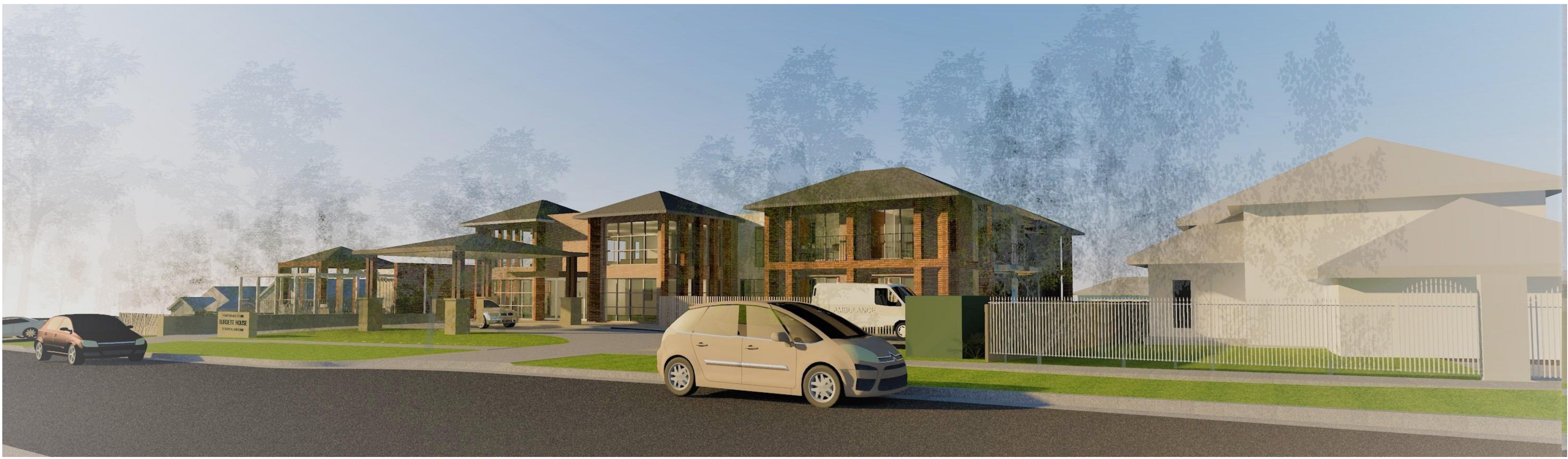
BURDETT STREET SOUTH EAST VIEW