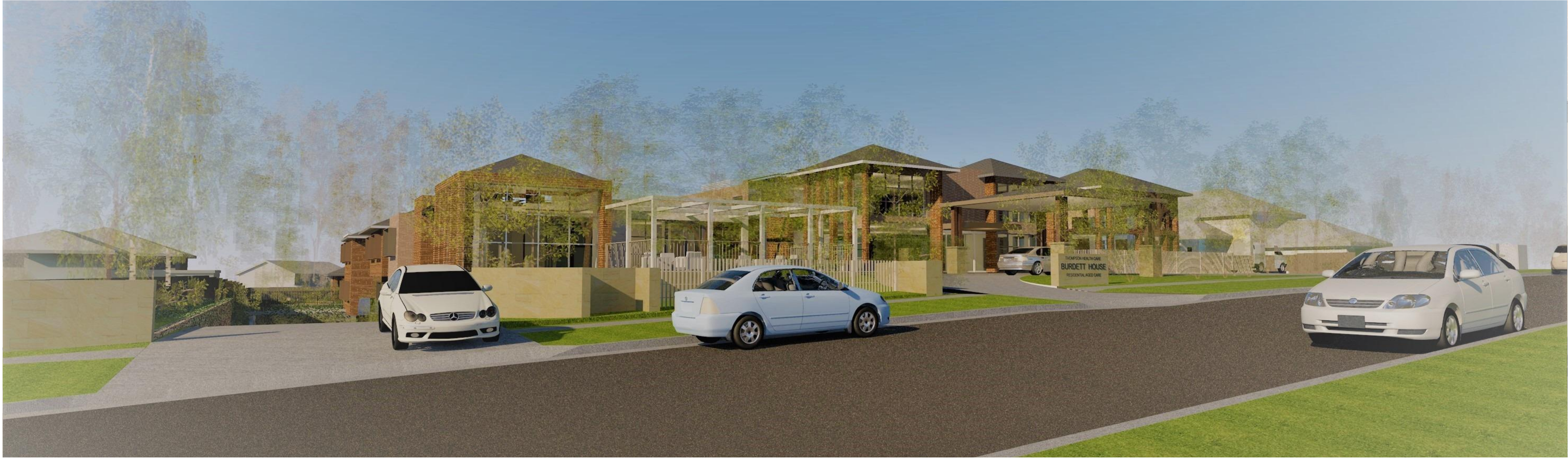
BURDETT STREET SOUTH WEST VIEW